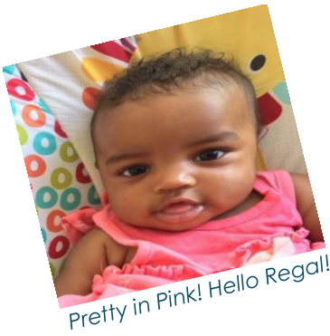
Pretty in Pink! Hello Regal!

Here are a few special moments caught on camera!